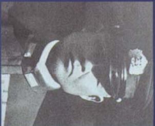
Rear Admiral Minoru Ota

Rear Admiral Minoru Ota, commanding officer of the Japanese Navy Underground Headquarters, and his six officers shot themselves due to the Americans' severe attack on the night of June 13, 1945. In his farewell telegram to the Navy Vice Admiral, Ota commended the Okinawan people for their cooperation and self-sacrifice and appealed for special consideration for them.