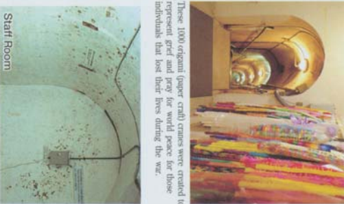
These 1000 original paper cradl crosses were created to represent grief and pray for world peace for those individuals that lost their lives during the war.